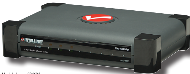
Model shown: 524124