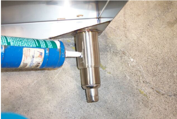
Figure 3—Applying silicon