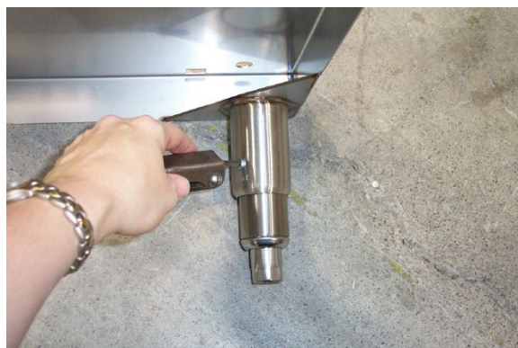
Figure 2—Tightening the legs

flip the dishmachine stand over and set it down on all four legs. Ensure that the legs are stable.