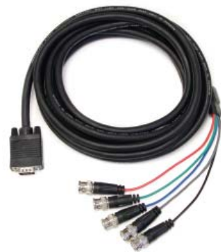
Cable: RGB-5HD15-X (X = Length in feet 6, 10, 15, 20)