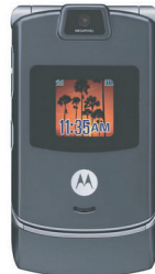
Motorola RAZR V3c