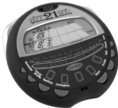
Model 74050 For 1 player / Ages 8 and up INSTRUCTION MANUAL P/N 82384000 Rev.A