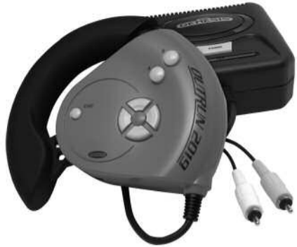
Model 75043 For 1 player / Ages 8 and up INSTRUCTION MANUAL P/N 82392110 Rev.A