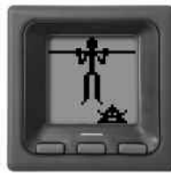
SLIM: Pull Up