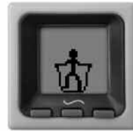
WHIP: Jump Rope

MOTION SENSORS - Play with and pester each STICK MAN™ by shaking or tumbling the cube.