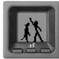
SCOOP: Keep Away