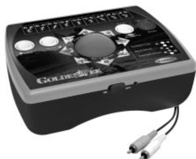
MODEL 76081 For 1 to 4 players / Ages 8 and up INSTRUCTION MANUAL P/N 823A2010 Rev.A