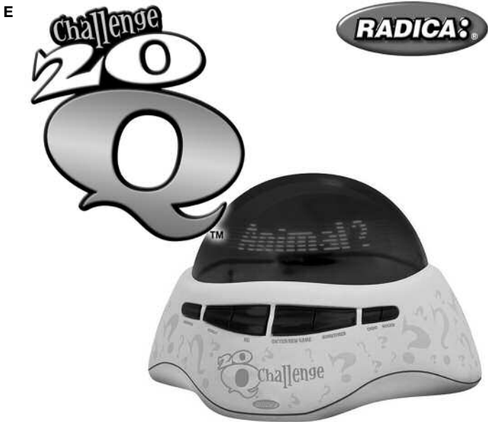
Model 75038 For 1 to multiple players / Ages 8 and up INSTRUCTION MANUAL P/N 82393200 Rev.A