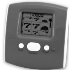
Asst. N7315 N6058