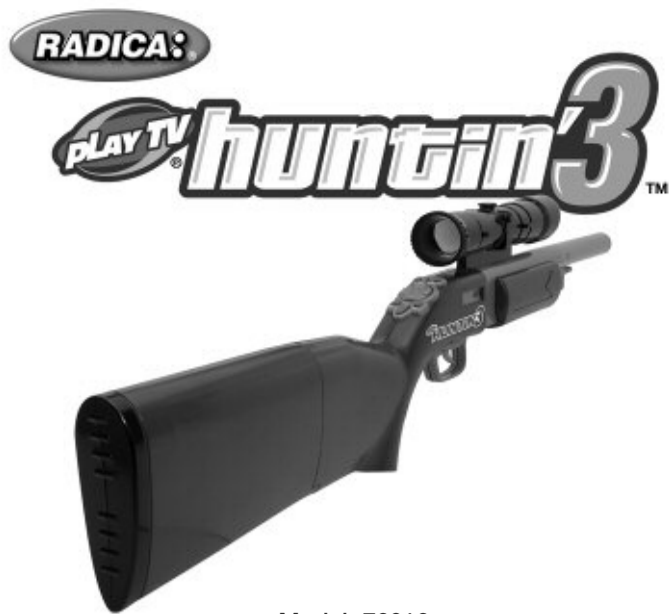
Model 76016 For 1 player / Ages 8 and up INSTRUCTION MANUAL P/N 823A1800 Rev.B