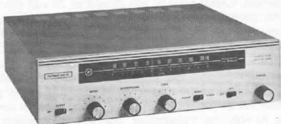
MODEL 841-40 FM RECEIVER

WARNING: TO PREVENT FIRE OR SHOCK HAZARD, DO NOT EXPOSE THIS RECEIVER TO RAIN OR MOISTURE.