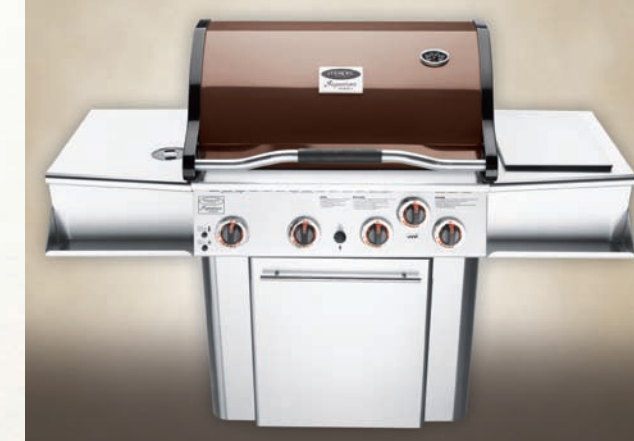
Deep Bronze Porcelain Enamel

Available on 4-Burner Model: VCS4027 Available on 5-Burner Model: VCS5027