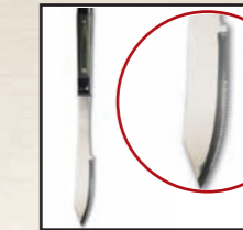
Signature Series Grill Knife Long wood handle, with sharp stainless steel blade and serrated tip. (VCK6A)