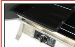
CAST IRON wood chip box has a convenient sliding shelf for easy chip removal.