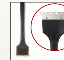
Signature Series Grill Cleaning Brush Long wood handle, with stainless steel scraper and brass bristles. (VCGB6A)