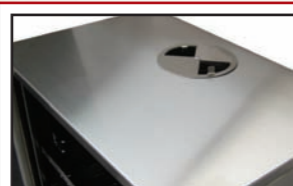
FULLY-ADJUSTABLE DAMPERS allow for precise smoking.