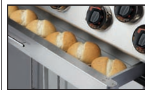
Convenient WARMING DRAWER keeps breads and buns warm and toasty!