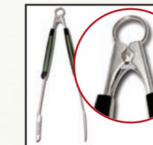
Signature Series Grill Tongs Long wood handle, with specially designed stainless steel ends for use as a turner or a tong. 3 settings to adjust to your hand size. (VCT6A)