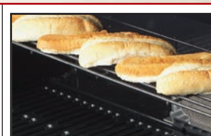
TOP WARMING RACK allows you to keep food warm and toasty.