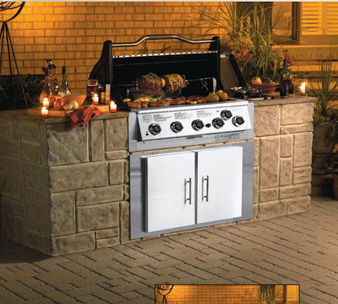
Model: VCS5007BI 5-Burner 62,500 BTU Stainless Steel Grill (island not included)