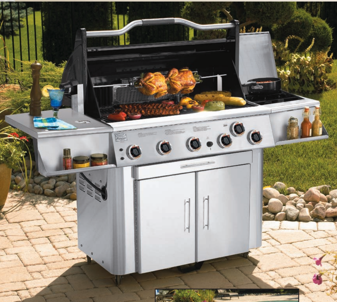
Model: VCS5007 5-Burner 62,500 BTU Stainless Steel Grill