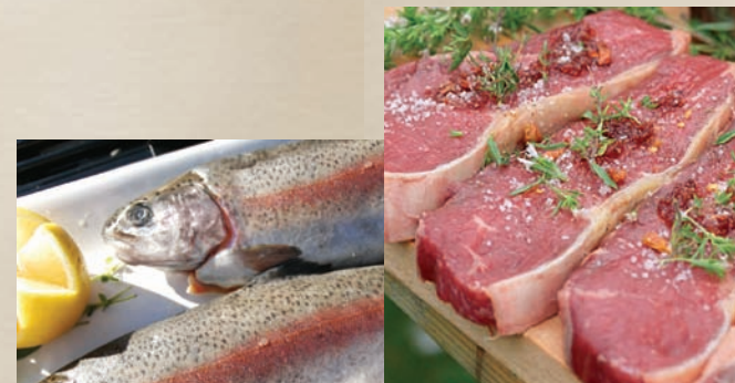
Download from www.Somanuals.com . All Manuals Search And Download.

BRING OUT THE BEST IN YOUR FOOD AND YOU.