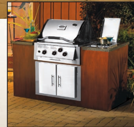
Signature Series | 3-Burner Built-In Grills

More compact, but still a giant in built-in efficiency and beauty. 400 square inch primary and 150 square inches of secondary cooking area, a convenient warming rack, a 15,000 BTU Infra-Red Rotisserie Cooking System, NeverFail Electronic Ignition and more! A great way to enjoy the luxuries of outdoor living anytime you want!