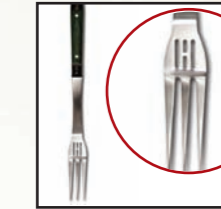
Signature Series Grill Fork Long wood handle, with 3 prong stainless steel tines. (VCF6A)