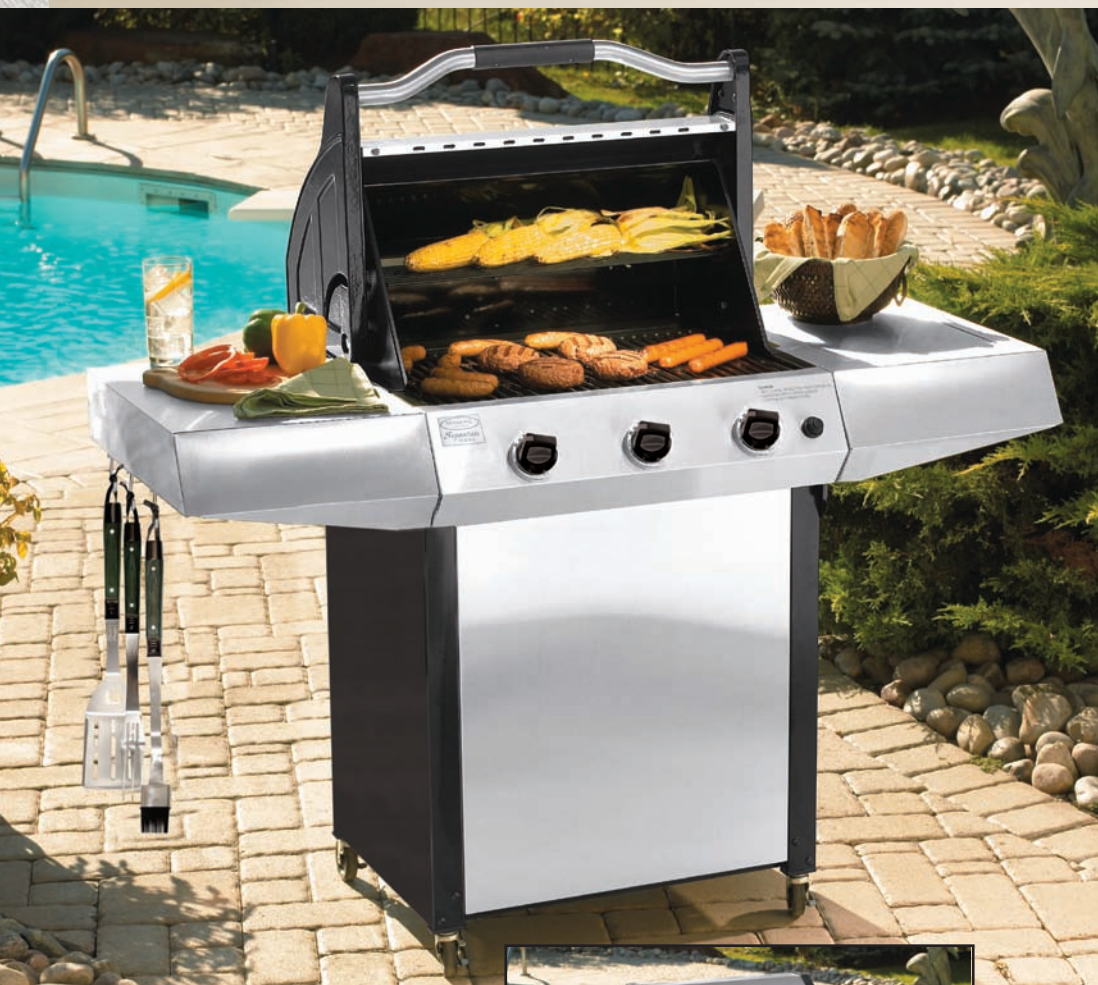
Model: VCS3507 3-Burner 37,500 BTU Stainless Steel Grill