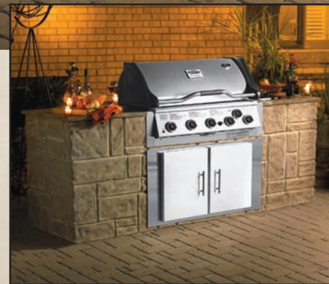
Signature Series | 5-Burner Built-In Grills

The perfect way to complement your outdoor living, Vermont Castings Built-in gas grills are every inch a Vermont Castings Signature Series masterpiece. Each can be installed into a complete outdoor cooking center, with options that include built-in side burner and front door assembly.