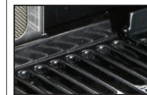
HEAVY CAST IRON PORCELAIN-COATED COOKING GRATES retain heat for even cooking, and won't allow foods to stick.