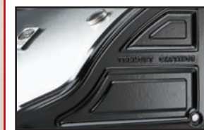
Our double-walled lid panels and CAST IRON HOOD END CAPS help retain the heat for more efficient cooking and superior flavor retention.

Cast Iron and Stainless Steel, this 4 burner grill is a monument to modern grilling. The perfect size for many different outdoor applications, this grill has 450 square inches of primary cooking area and 170 square inches of secondary cooking space. 15,000 BTU Infra-Red Rotisserie Cooking System and our super-thick cast iron cook grids with rear lip make this the grill to envy. Includes "SoftTouch" back-lit dials, a 15,000 BTU Side Burner for sauces, potatoes, baked beans and more...it all adds up to a great grill and a great value. Available with a Stainless Steel Lid, or Limited Edition Porcelain Enameled lids in: Mica Black, Mica Green or Deep Bronze.