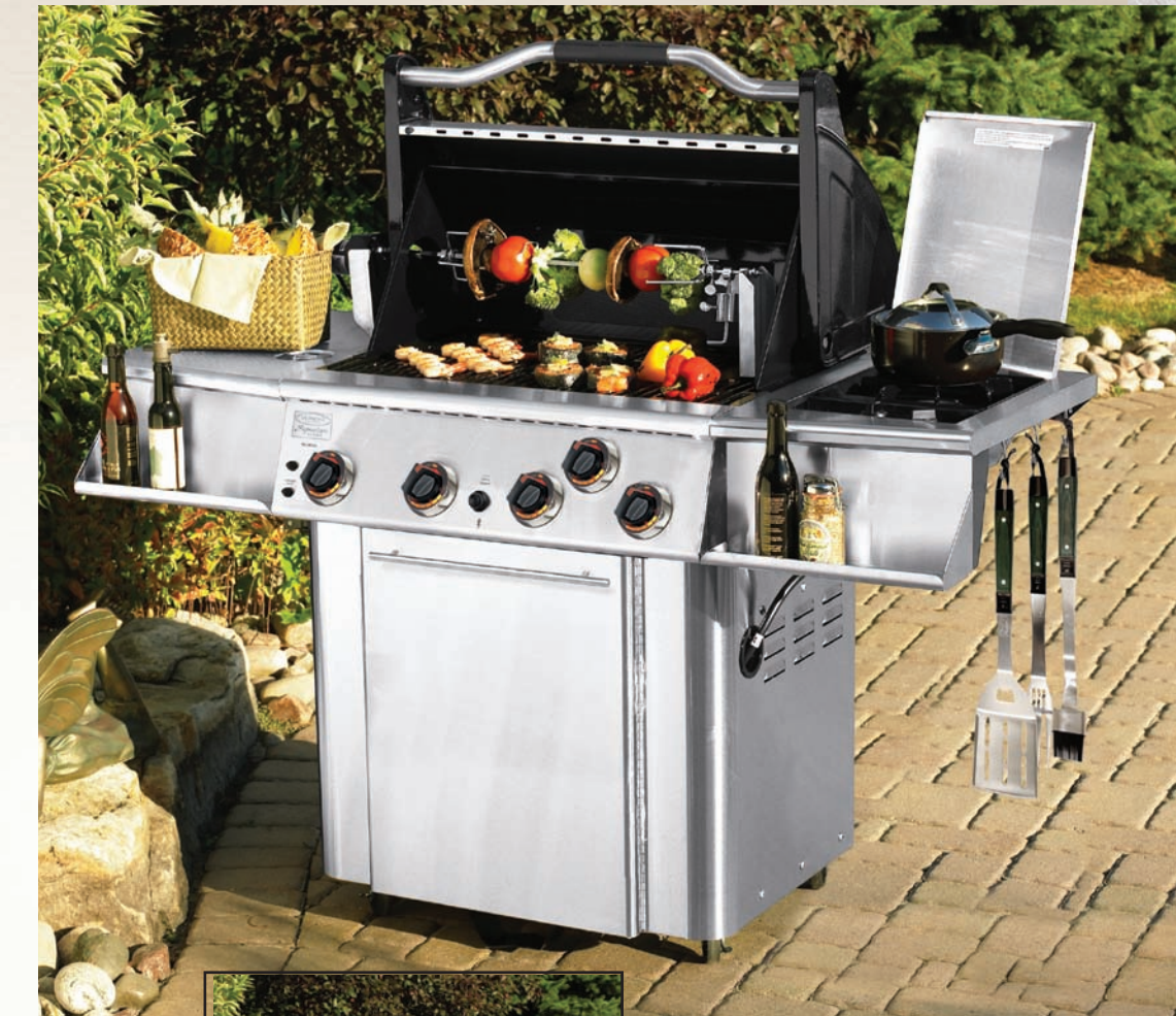
Model: VCS4007 4-Burner 50,000 BTU Stainless Steel Grill