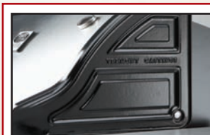
Our double-walled lid panels and CAST IRON HOOD END CAPS help retain the heat for more efficient cooking and superior flavor retention.

Comes with flush mounted side shelves, an option to add a 15,000 BTU side burner, enclosed Stainless Steel Cart Design, commercial grade castors and much more! Available with a Stainless Steel lid, or with a Limited Edition Porcelain Enameled Mica Black lid.