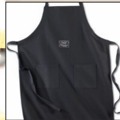
Signature Series Grill Apron Durable Vermont Castings canvas apron with two large pockets. One size fits all. (VCBA6A)