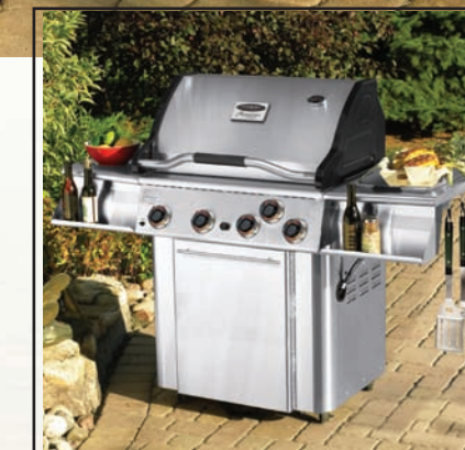
Signature Series | 4-Burner Grills

Cast Iron and Stainless Steel, this 4 burner grill is a monument to modern grilling. The perfect size for many different outdoor applications, this grill has 450 square inches of primary cooking area and 170 square inches of secondary cooking space. 15,000 BTU Infra-Red Rotisserie Cooking System and our super-thick cast iron cook grids with rear lip make this the grill to envy. Includes "SoftTouch" back-lit dials, a 15,000 BTU Side Burner for sauces, potatoes, baked beans and more...it all adds up to a great grill and a great value. Available with a Stainless Steel Lid, or Limited Edition Porcelain Enameled lids in: Mica Black, Mica Green or Deep Bronze.