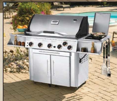
Signature Series | 5-Burner Grills

A beautiful, polished stainless steel lid marks this 5 burner grill as one of the most distinguished around. Delivering superior flavor, outstanding heat retention, and remarkable efficiency, no other grill can match our cooking system. 600 square inches of primary cooking area and 230 square inches of secondary cooking space can accommodate a full three-course meal and more. Double condiment trays, a 20,000 BTU Infra-Red Rotisserie Cooking System, "SoftTouch" back-lit dials and more, it's all here and ready to grill. Add our heavy duty Signature Series Grill Cover, our "Sizzling Barbeque" Cook Book, and you'll bring out the best in any meal. Available with a Stainless Steel Lid, or Limited Edition Porcelain Enameled lids in: Mica Black, Mica Green or Deep Bronze.