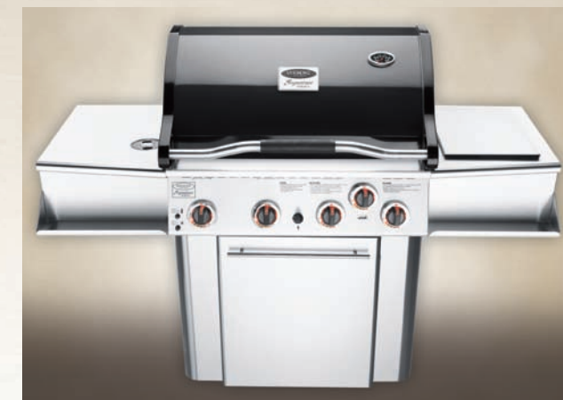
Mica Black Porcelain Enamel

Available on 3-Burner Model: VCS3517 Available on 4-Burner Model: VCS4017 Available on 5-Burner Model: VCS5017