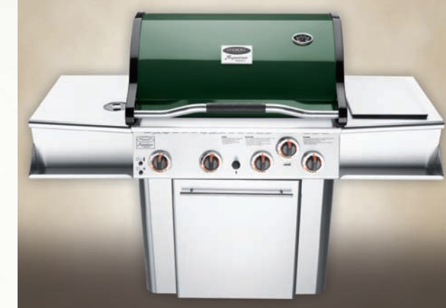
Mica Green Porcelain Enamel

Available on 3-Burner Model: VCS3517 Available on 4-Burner Model: VCS4017 Available on 5-Burner Model: VCS5017