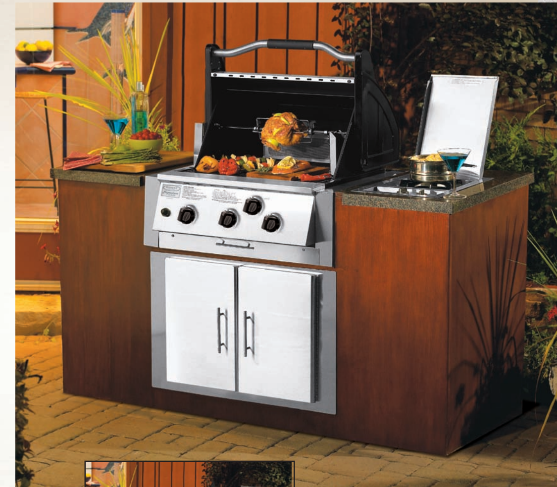
Model: VCS3507BI 3-Burner 37,500 BTU Stainless Steel Grill (island not included)