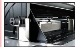
Our ROTISSERIE KIT AND BURNER allows for slow and even cooking for roasts and whole chickens, every time.

A beautiful, polished stainless steel lid marks this 5 burner grill as one of the most distinguished around. Delivering superior flavor, outstanding heat retention, and remarkable efficiency, no other grill can match our cooking system. 600 square inches of primary cooking area and 230 square inches of secondary cooking space can accommodate a full three-course meal and more. Double condiment trays, a 20,000 BTU Infra-Red Rotisserie Cooking System, "SoftTouch" back-lit dials and more, it's all here and ready to grill. Add our heavy duty Signature Series Grill Cover, our "Sizzling Barbeque" Cook Book, and you'll bring out the best in any meal. Available with a Stainless Steel Lid, or Limited Edition Porcelain Enameled lids in: Mica Black, Mica Green or Deep Bronze.