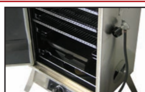
ELECTRONIC IGNITION starts quickly every time, whenever you're ready.