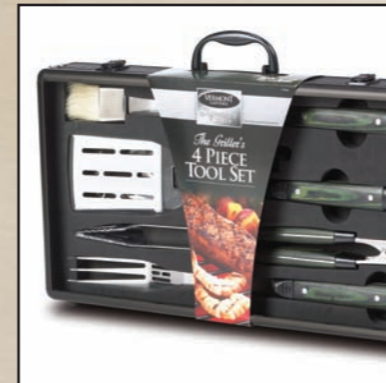
Signature Series 4 Piece Tool Set with Case Includes Signature Series tongs, turner, fork, basting brush (boar bristle) and extra basting head (silicone). (VCTK6A)

Cast iron griddle plate Replace one cooking grate with this griddle and you've got the perfect outdoor stir-fry surface. Great for pizza, bacon & eggs in hardly any time at all. (VCGP1A)