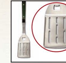
Signature Series Grill Turner Long wood handle, with stainless steel serrated end and convenient built-in bottle opener. (VCS6A)