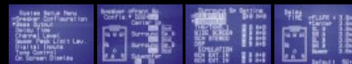
System Setup Menu Easy setting of speaker configuration User-friendly guide for making settings Adjusting the delay time

The AVC-A1D is equipped with an On-Screen Display (OSD) featuring icons (pictorial representations) to let you easily monitor the current operating status. The OSD feature lets you check or change the source you want to see, listen to or record, and you can also monitor or change the speakers, surround sound mode, delay time, channel level, digital inputs or listening parameters. What once required a number of complicated operations can now be accomplished via a quick glance at the AVC-A1D's OSD, which has been refined for greater ease of operation.