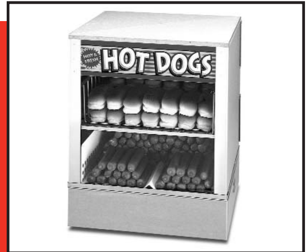
Model: DS-1A Hot Dog Display Steamer