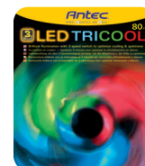
Trilight TriCool LED Fan

80mm UPC #: 761345-75022-6 120mm UPC #: 761345-75026-4