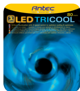
Blue TriCool LED Fan

80mm UPC #: 761345-75020-2 120mm UPC #: 761345-75024-0