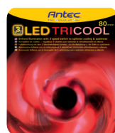
Red TriCool LED Fan

80mm UPC #: 761345-75021-9 120mm UPC #: 761345-75025-7