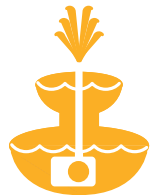
Medium Fountains Up to 3 ft high