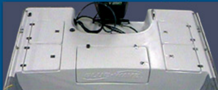
Back Casting Deck