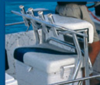
Aluminum Leaning Post