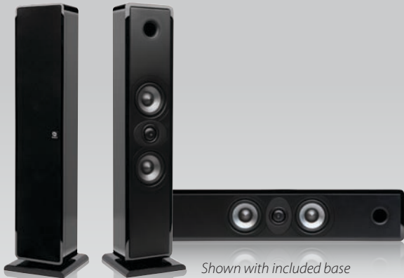
Shown with included base