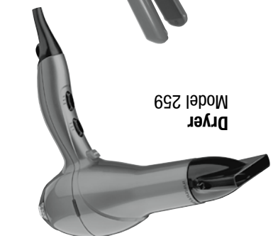
Model 259 Dryer

TRY OUR OTHER INFINITI PRO BY CONAIR™ PRODUCTS