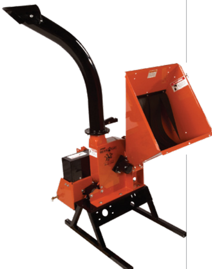
Shown here is the model CH4540, 4" PTO CHIPPER. 540 rpm, Self-Feed