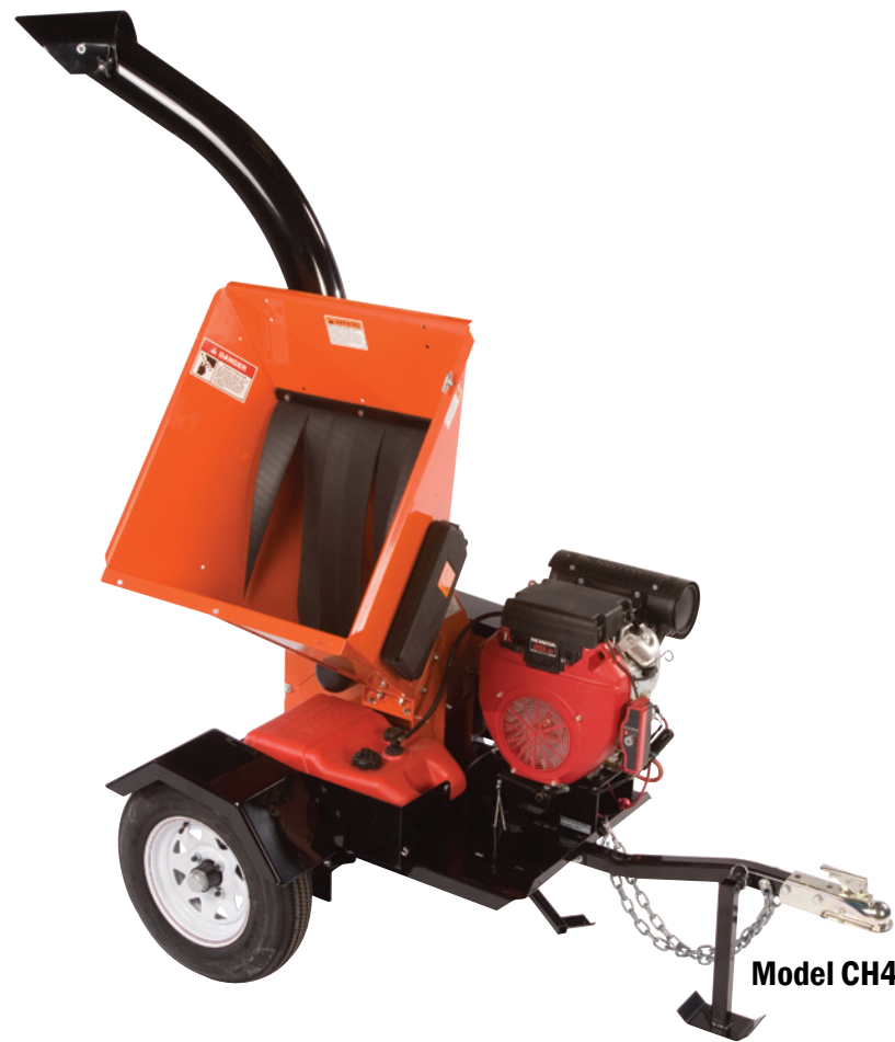
Model CH4614 (73420)