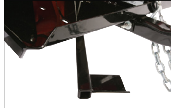
Convenient foot pedal releases tension from the belts acting as a starting aid.