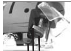
BLADE COLLET COLLET LEVER ROLLER GUIDE