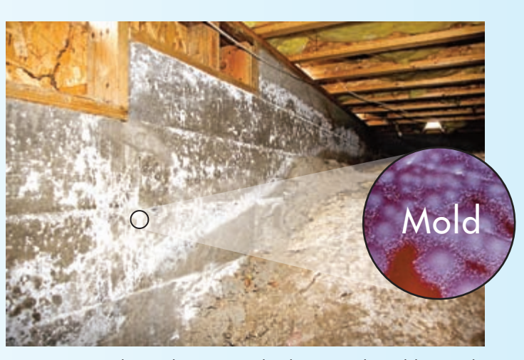
Typical crawl space under home with mold growth