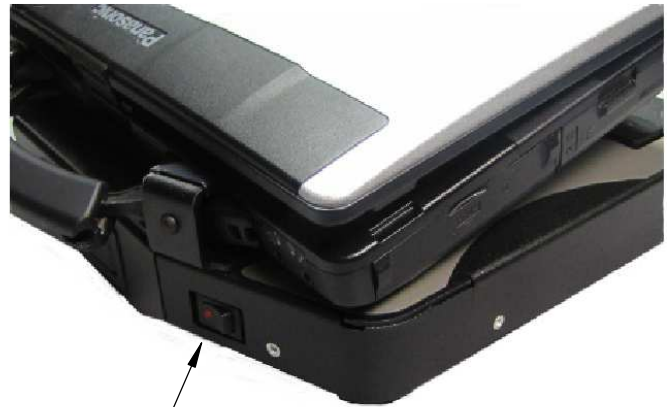
Dock Power Switch